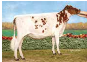
Palmyra Lochinvar B Rejoice-ET 2x AA Nominee • Next dam is Ruth, EX-94 2E • 2x WDE Grand • 3x UAA March Kingsire calf sells!