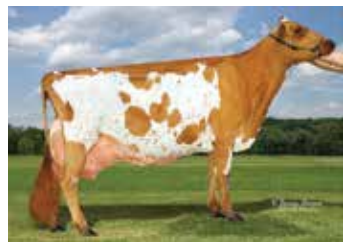
Yellow Briar Burdette Panama, EX-94 3E 2x Res AA 7-02 360D 35,160M 3.8% 1326F 3.2% 1136P Barclay summer yearling granddaughter sells!