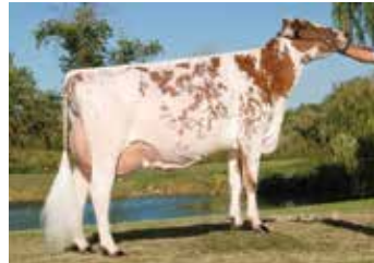
Kler-Vue Ramius Christmas, EX-93 4E 3x AA • Over 120,000M Lifetime Reagan granddaughter sells ready for summer Jr. 2 class!