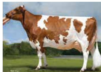
Old-Bankston JC Malibu-ET, EX-94 2E 2 records over 20,000M • Granddam EX-96 2E Minerva, 5x AA, 2x WDE Grand Sept. pick of flush sells sired by Burdette, Reynolds or Reagan!