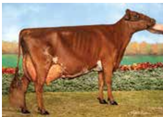
Toppglen Wishful Thinking-ET, EX-94 3E 3-03 305D 20,210M 6.7% 1348F 6.1% 1232P 2x UAA Spring calf family member by Melios sells!