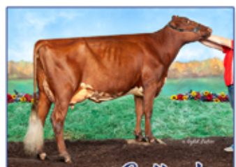
Heavenly Mega Cutiepie ET 1st Jr 3 Yr Old Eastern Natl Jr Show; Intermediate Champion, Resv Grand Champion Eastern Natl Jr Show 2021; 3rd Jr 3 Yr Old Eastern Natl Open Show; Nominated Jr AA, Jr 3 Yr Old 2021; Due in June sells fresh. Will be a contender for 4 yr old

Selling 40 Milking Shorthorns • Millcreek Farm dispersal of bred heifers and milk cows along with consignments from Cold Springs Farm, Hard Core Farm and other guest consignors • 40 Guernseys will be selling • Consignments from Snider Homestead, Warwick Manor and other guest consignors Also selling 10 head of Jerseys