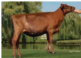
Blackstone R Vengeance-ET Nom AA Winter Calf, 2021 2nd & 3rd dams EX She sells!