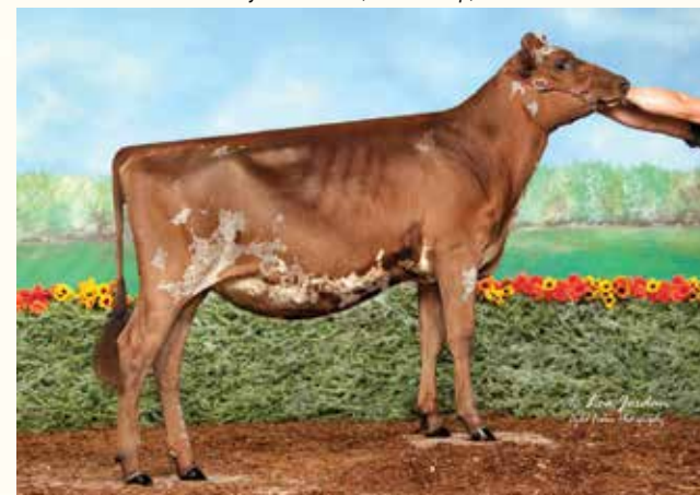
Fishersons Burdette Mary Kay-ET