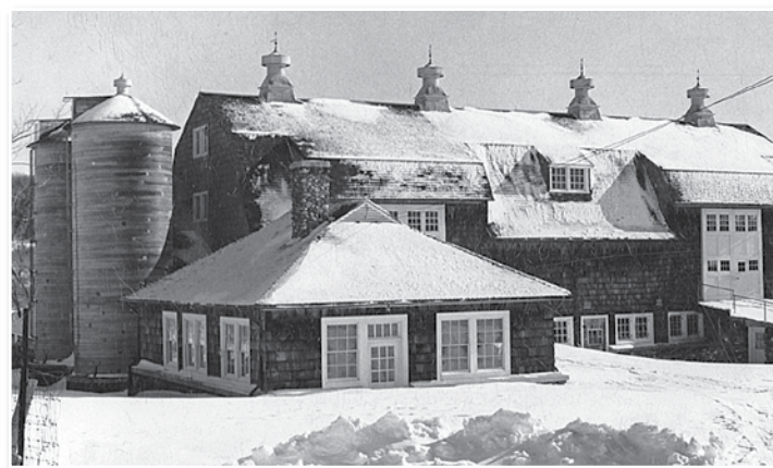
Wachusett Meadow Cow Barn With Milking Shed in Front