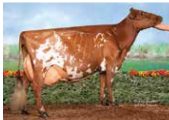
Hardy Farm Prime Kringle, EX-94 2E Res AA Aged Cow, 2021 Over 25,000M Ringer Fall Calf out of maternal sister sells!