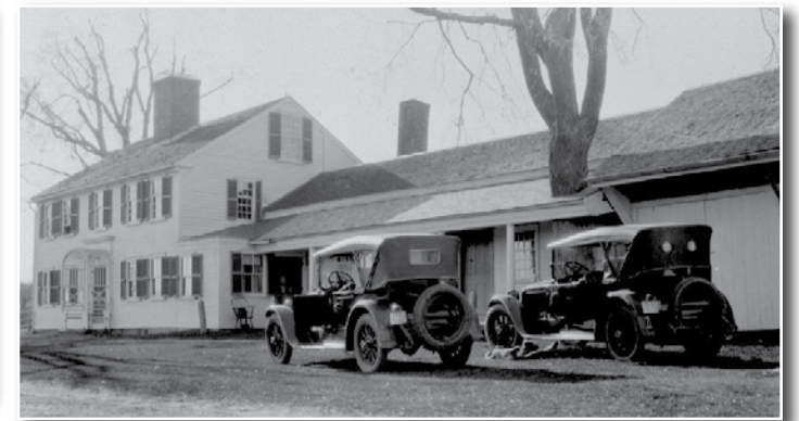
Early 1930s - note tree through porch roof

The manure barn (now called the Hey Day Inn) stored manure from the farm's animals. It was filled with manure on the sides