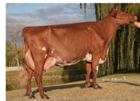
Lands-Brook Christina EXP-ET 4EE96 Granddam of Embryos Selling

Sire: Halpins Muddy Rockstar TW Dam: Lands-Brook Cocaine-ET 3E-91 5-02 259D 19486M 4.5 881F 3.1 596P