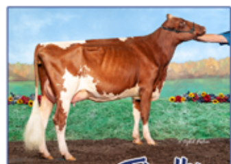
Millcreek Blaine Firefly EXP 1st Sr Yr in Milk Eastern Natl Jr & Open Shows 2021. Nominated AA Sr Yr in Milk Jr & Open 2021; Due in September to B-D-F Marshas Money