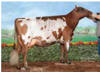
Jomill Burdette Kaliente-ET, VG-87 Jr. AA & Nom AA Milking Yearling, 2021 Jr. AA Fall Calf, 2020 Reagan IVF embryos sell!