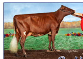
Millcreek Blaine Sophia 1st Jr 2 Yr Old Eastern Natl Open Show; 2nd Jr 2 Yr old Eastern Natl Jr Show 2021; Will be fresh in June and ready to roll