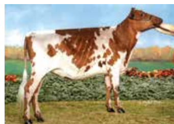
Kozy Kountry Reagan Peekaboo 2021 Res AA Winter Yearling Spring calf full sister sells!

Watch and bid from anywhere with the service at www.cowbuyer.com