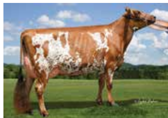
Old-N-Lazy TSB Watch This-ET, EX-93 3-01 342D 22,730M 4.2% 952F 3.3% 740P She sells due this summer!