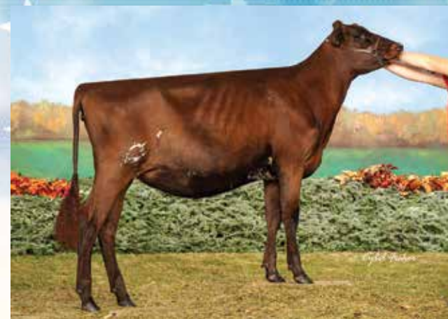
Flambeau Manor King Bacardi