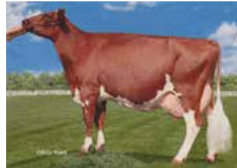
Maple-Dell Zorro Dafourth, EX-95 2E 6-01 365D 30,950M 4.5% 1387F 3.0% 939P 2x Res AA Reagan summer yearling granddaughter sells!