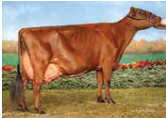
Marilie Gentleman Karmina, EX-94 8-03 305D 35,880M 3.6% 1302F 2.9% 1041P WDE Grand 2021 • 4x AA Dec. Autograph pick of flush sells!