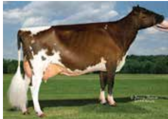
Emerald-Farms Pokers Sweetheing, EX-94 4E 5-11 365D 22,690M 4.1% 925F 3.3% 756P Nom AA Reynolds IVF embryos sell!