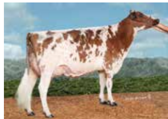
De La Plaine Remington Wing-ET, EX-92 2E 4-11 322D 28,290M 4.5% 1274F 3.3% 934P Benedict P spring calf sells!