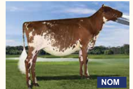
Deer-Hill Kingsire Flashyjet