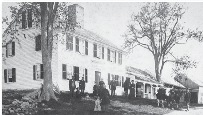
Wachusett Meadow 1887 – Goodnow Family & hired hands

Past these barns and on the house side of the road, we reined in our horse at the horse barn. It is gone now. It stood somewhat forward of the long ell of the house, attached to the ell beyond the open carriage stalls. It was a story high, with a roof that pitched toward the road. I remember how the inside of the barn looked as we led our horse into one of